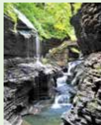
Watkins Glen State Park

Allan H. Treman Marine Park Buttermilk Falls (excludes Jennings Pond) Canandaigua Lake Marine Park Cayuga Lake Chimney Bluffs + Dean's Cove Boat Launch + Fair Haven Beach Fillmore Glen Honeoye Lake Boat Launch + Keuka Lake Lodi Point* Long Point Robert H. Treman Seneca Lake Stony Brook