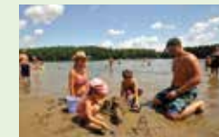
Moreau Lake State Park

Cherry Plain Grafton Lakes Max V. Shaul Mine Kill* Moreau Lake Peebles Island* + Saratoga Lake State Boat Launch + Saratoga Spa Schodack Island Thacher Thompson's Lake-Thacher +