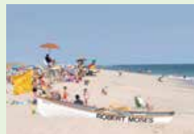
Robert Moses State Park

Bayard Cutting Arboretum Belmont Lake Bethpage Caleb Smith Preserve Camp Hero Captree Caumsett State Historic Park Preserve Connetquot River State Park Preserve Hallock Heckscher Hempstead Lake Hither Hills Jones Beach Montauk Downs Montauk Point* Nissequogue River Orient Beach Planting Fields Arboretum State Historic Park Robert Moses Sunken Meadow Valley Stream Wildwood