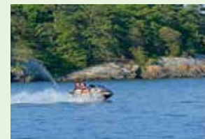
Wellesley Island State Park

Burnham Point + Canoe-Picnic Point + Cedar Island* + Cedar Point Coles Creek Cumberland Bay Dewolf Point Eel Weir Grass Point Higley Flow Jacques Cartier Keewaydin Kring Point Long Point Macomb Reservation Mary Island + Point Au Roche Robert Moses Southwick Beach Waterson Point* + Wellesley Island Westcott Beach Whetstone Gulf