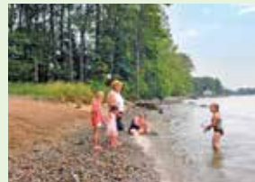
Mexico Point Boat Launch

Canadarago Boat Launch Chenango Valley Chittenango Falls + Clark Reservation Delta Lake Gilbert Lake Glimmerglass Green Lakes Mexico Point Boat Launch + Pine Grove Boat Launch + Sandy Island Beach Selkirk Shores Verona Beach