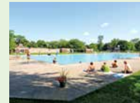
Fort Niagara State Park

Artpark Beaver Island Big Six Mile Creek Marina + Buffalo Harbor Evangola Fort Niagara Four Mile Creek Golden Hill Niagara Falls Wilson-Tuscarora Woodlawn